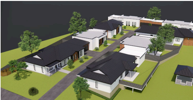
Ferntree Gully, VIC