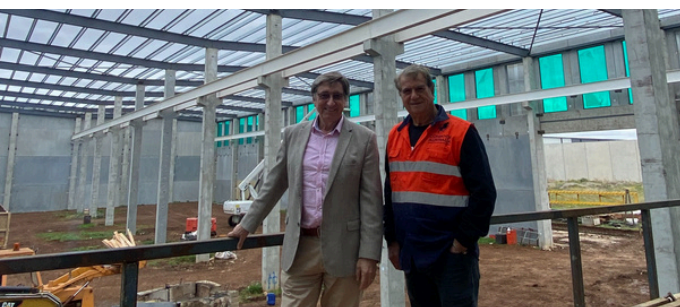
Truganina Factory, VIC