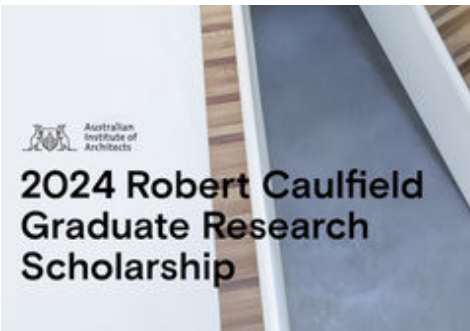
The winner will be announced at the Victorian chapter end-of-year gala.