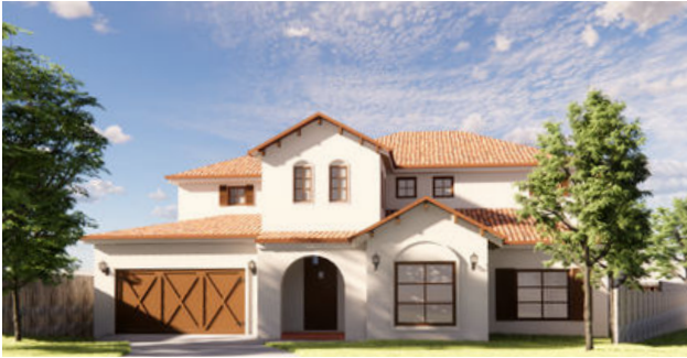
Mont Albert Residence, VIC

Just completed, The Boathouse graces the shores of Kananook Creek, a stone's throw from Seaford Beach. Despite confronting planning challenges such as flood, bush fire, Aboriginal sensitivity overlays and strict ResCode requirements, we have crafted a grand and spacious design for this compact dwelling. Working within a specific budget, our team designed solutions to maximize both comfort and style at an affordable price. This impressive residential project, featuring low-cost lightweight materials, boasts two distinct yet seamlessly integrated facades facing the creek and the street. It stands as a testament to stylish, affordable design.