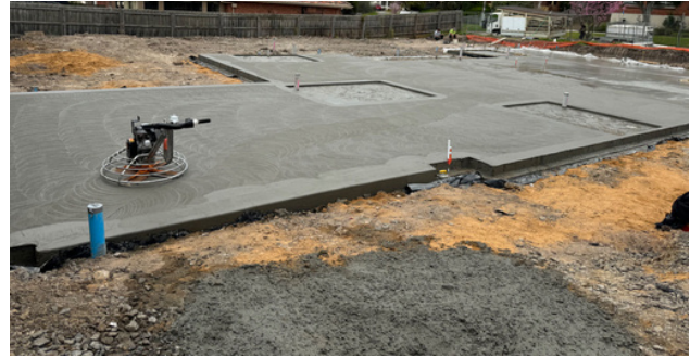
The first concrete pour.